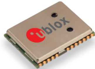
NEO-7 series: 12.2 x 16.0 x 2.4 mm